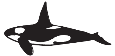
Killer Whale ( Orcinus orca )