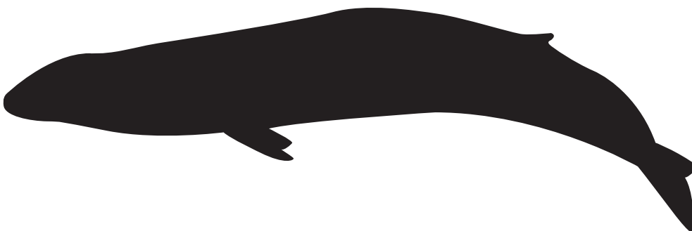
Blue Whale ( Balaenoptera musculus )